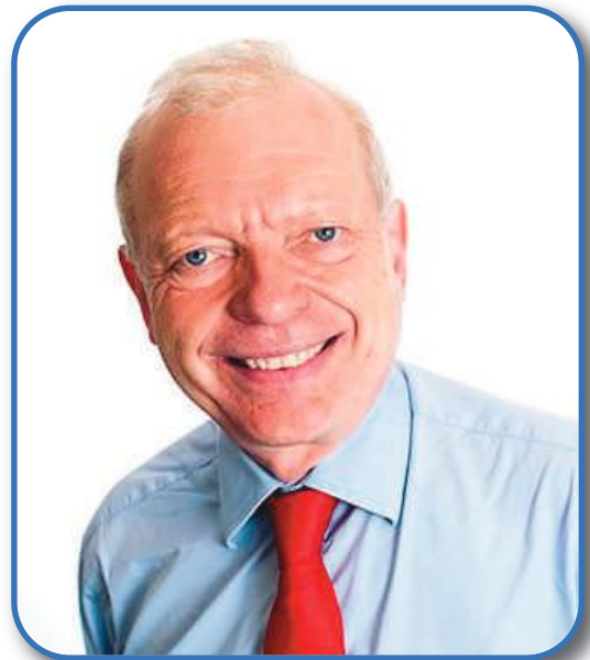
The Rt Hon Lord Hunt of Kings Heath PC OBE President, HCSA

Thank you on behalf of the NHS and indeed our country.