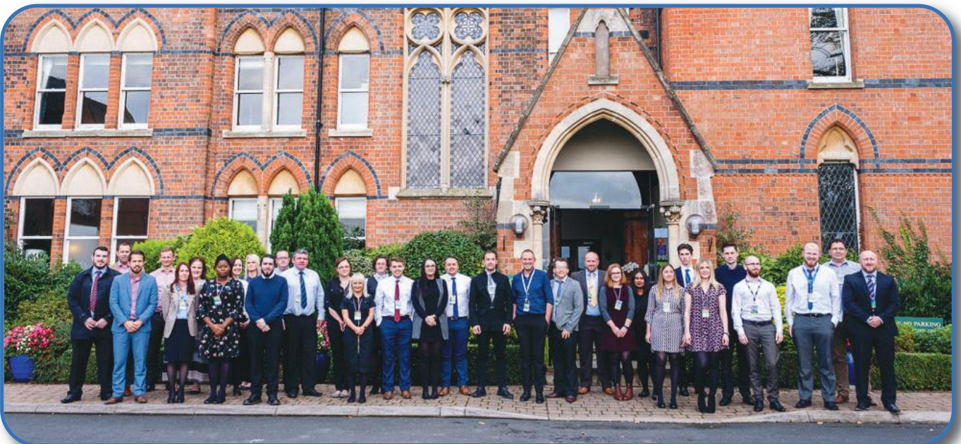
Picture: HCSA PDP at Ettington Chase - October 2017