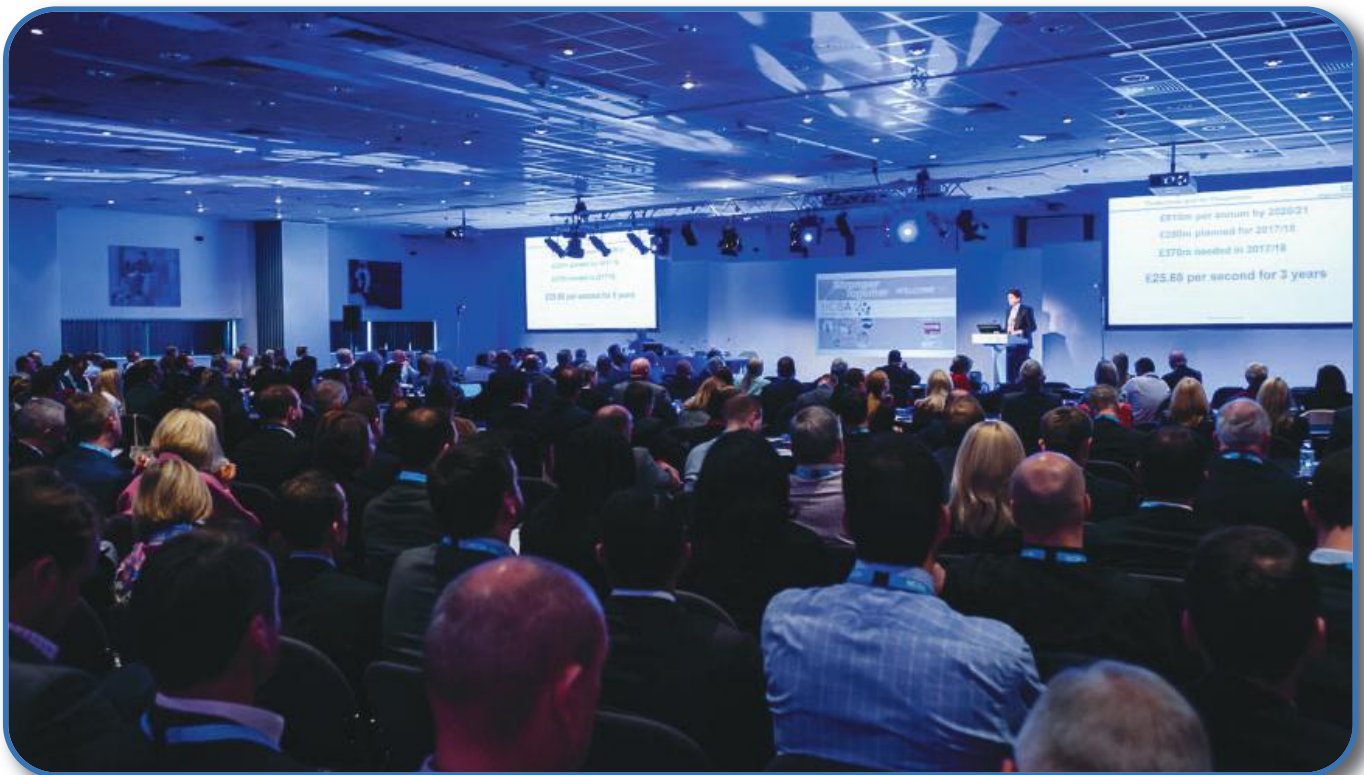
Picture: HCSA Annual Conference and Exhibition at the Harrogate Convention Centre November 2017

In November 2017 the HCSA staged its Annual Conference and Exhibition at the Harrogate Convention Centre. This was the biggest conference to date with the largest range of sponsors, exhibitors and delegates. The main programme featured speakers from different NHS stakeholder organisations; NHS Scotland; policy making bodies in England; procurement specialists; suppliers and procurement practitioners. Alongside the Conference we had eight good practice interactive workshops. The Conference was attended by circa 500 delegates over the two days rounded off by the Awards dinner to celebrate and recognise achievement.